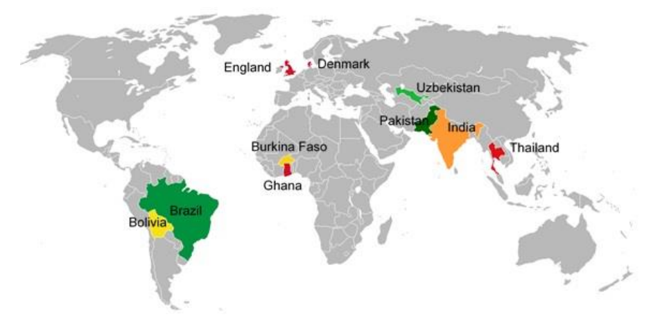
FIGURE 3. Distribution, topic, journal and publication year of the studies on water – ANT.

FIGURE 2. Geographical distribution of the studies included in the systematic review.