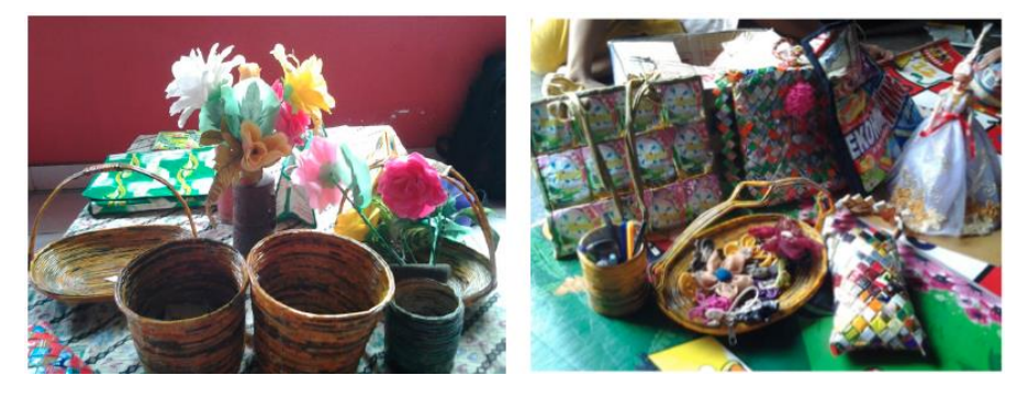
FIGURE 1. Inorganic waste recycling products become accessories.

They never sell bags from plastic packaging for Rp. 25.000, -. While Asna sell dolls berby handmade creations for Rp. 30.000,-.