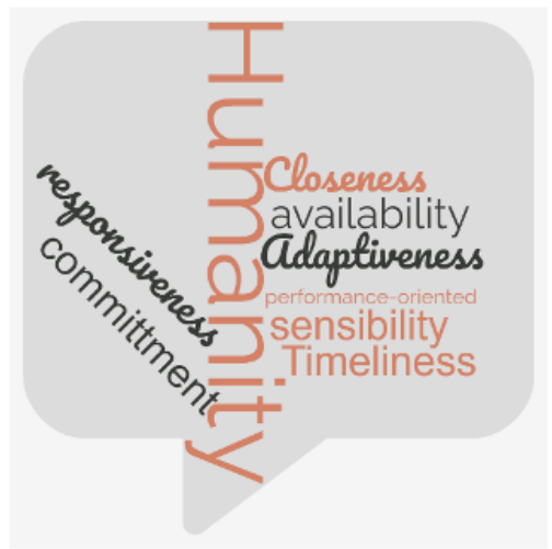
FIGURE 2. Tag cloud of Soft Skills.

Do Italians Communicate it Better? Exploring Public Organizations Professionals' Skills in Learning Environments